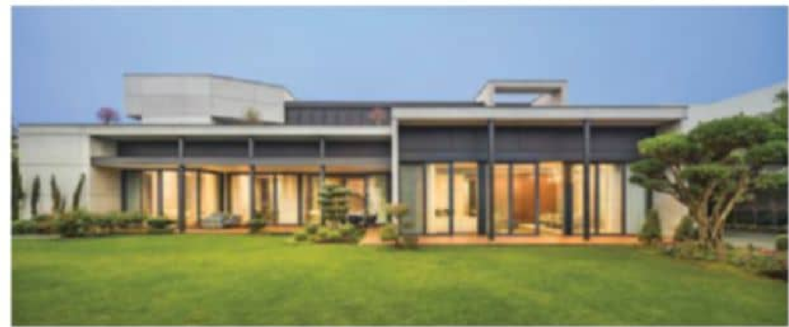
House of Sunwells in Ludhiana, Punjab

Rooted in the belief that architecture is a three-dimensional fabric shaped by movement and interaction, Habitat Architects approaches design with a strong focus on human experience, materiality and detail. The practice is known for its technical rigour, ability to manage complex projects, and a design language that emphasises texture, sensory engagement