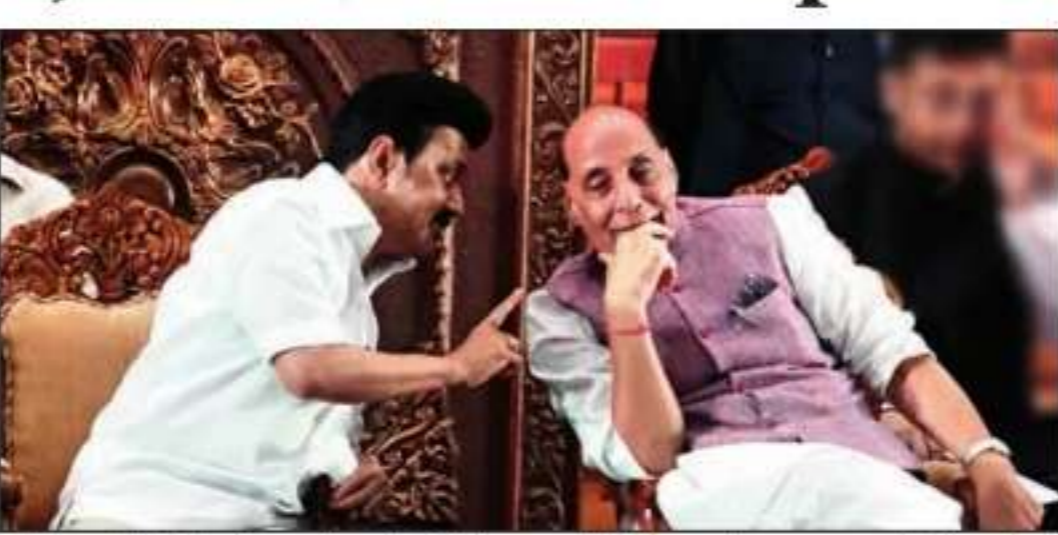
Stalin said Rajnath spoke about Karunanidhi 'in such a manner that not even our alliance party leaders or our own DMK men would have spoken'

"He (Rajnath) then surprised us by asking everyone to give a standing ovation to Kalaigarn. The gesture was overwhelming. He spoke about Karunanidhi in such a