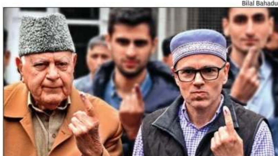
An NC functionary said Farooq & Omar alone have the capacity to keep the flock together and attract influential politicians from other parties