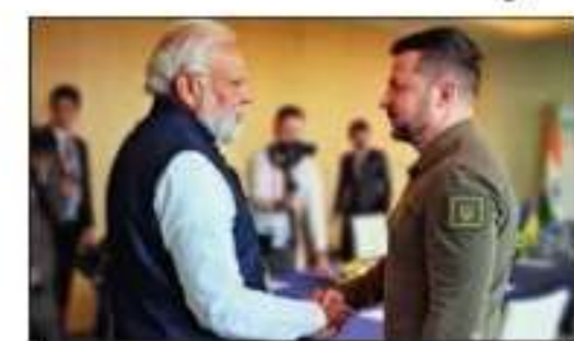
India indicated that its position on the Russia-Ukraine war — that peace is possible only through diplomacy — remains unchanged

New Delhi: Ahead of PM Narendra Modi's "landmark and historic" visit to Ukraine, Indian govt indicated Monday its position on the Russia-Ukraine war — that ensuring peace is possible only through dialogue and diplomacy and the involvement of both parties in any peace initiative — remains unchanged. Modi will undertake a 10-hour journey from Przemysl in Poland, on the border with Ukraine, to arrive in Kyiv on Friday for an eight-hour visit that will see him holding bilateral talks with President Volodymyr Zelensky and also interacting with Indian students in Ukraine.