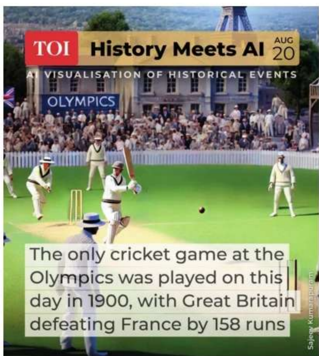
TOI History Meets AI AUG 20 A VISUALISATION OF HISTORICAL EVENTS OLYMPICS The only cricket game at the Olympics was played on this day in 1900, with Great Britain defeating France by 158 runs